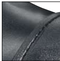
RTC with countersunk seams