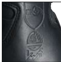
Chainsaw protection Class 1

Upper Material: waterproof leather, hydrophobic, breathable (5,0 mg/cm 2 /h), 2.5 – 2.7 mm thick Cut Protection: KEVLAR® protection against cuts certified with cut category 1 (20m/sec.)